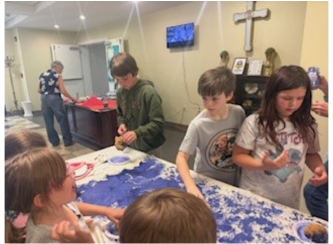
CIA helping with the Color Our World Soirée ladies banner.