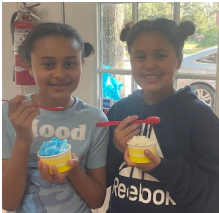
CIA took a trip to the Sweet Shop