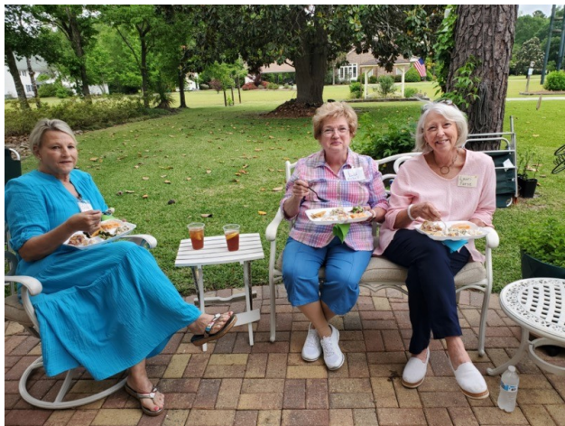
Jane Craft Circle