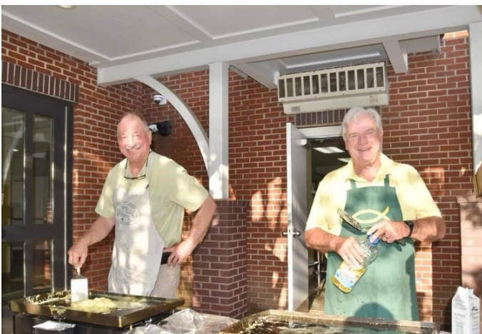
National Day of Prayer Breakfast pictured below

New members: you are cordially invited to join our pastor and staff for lunch on Sunday, June 12, immediately following the worship service. You will receive an invitation soon but