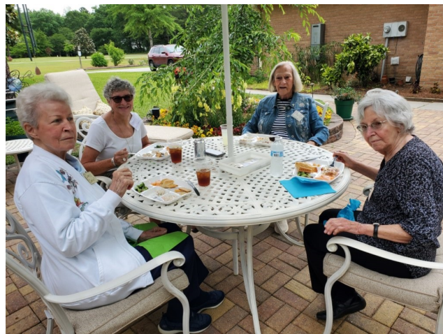
Jane Craft Circle welcomed new members at a luncheon. They are enjoying new Christian friendships.