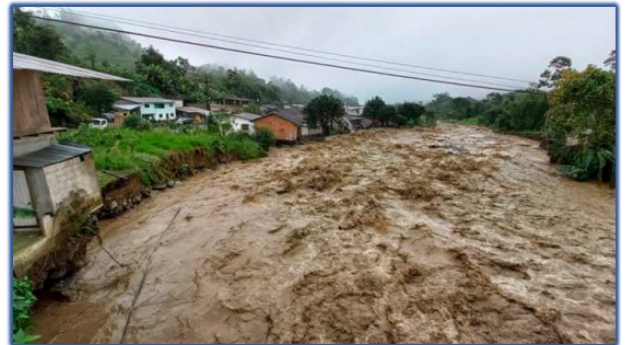
River South of Quito