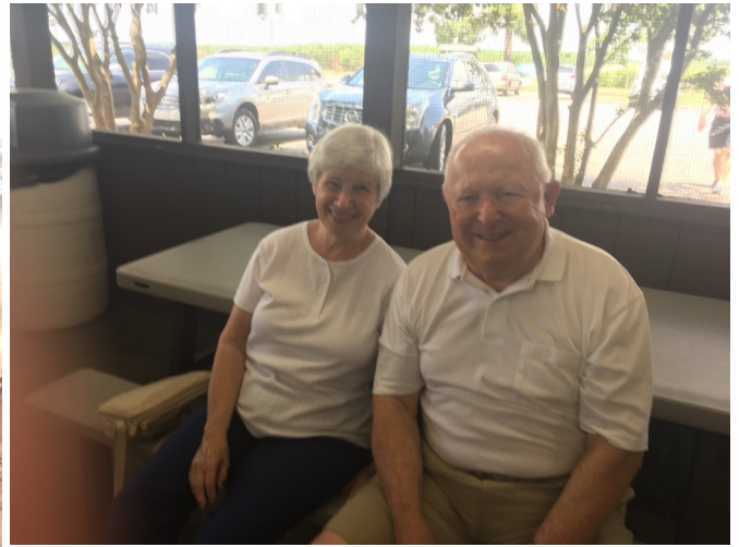
South Carolina Peaches