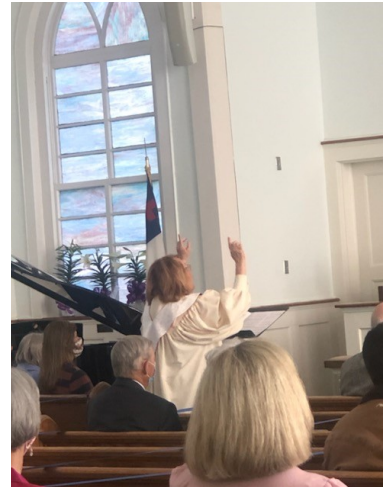
Wonderful Worship Services During Holy Week here at MUMC