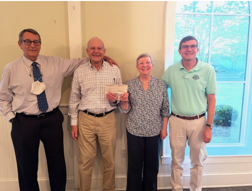
Pictured Below: Palm Sunday! CIA had the best time!

Pictured above: At the United Methodist Men's Supper we presented